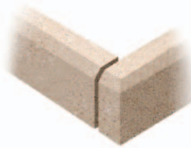
OUTSIDE CORNER Left Shown