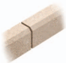
STANDARD END (Unfinished)